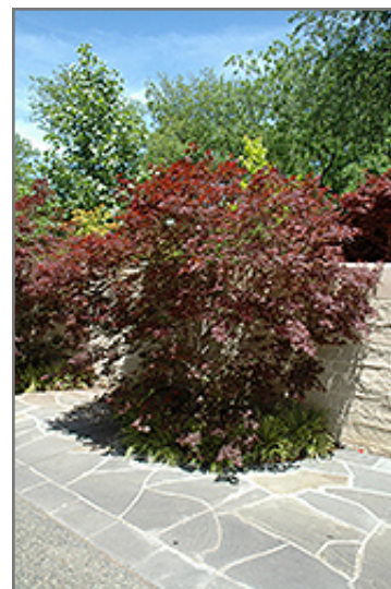
Sherwood Flame Japanese Maple