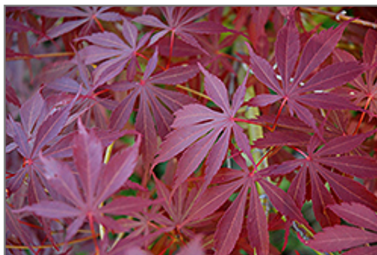
Sherwood Flame Japanese Maple foliage