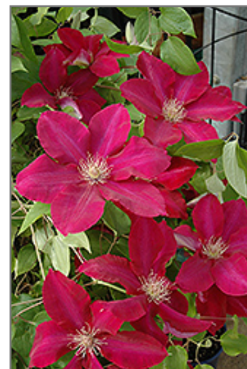
Rebecca Clematis flowers