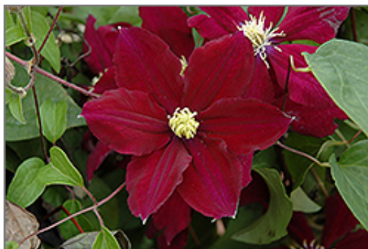
Rosemoor Clematis flowers