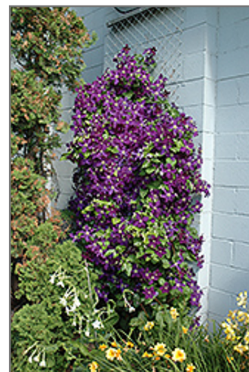
Jackmanii Superba Clematis in bloom