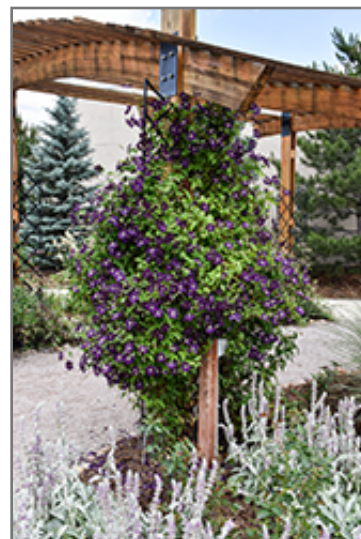
Jackmanii Superba Clematis in bloom

Jackmanii Superba Clematis makes a fine choice for the outdoor landscape, but it is also well-suited for use in outdoor pots and containers. Because of its spreading habit of growth, it is ideally suited for use as a 'spiller' in the 'spiller-thriller-filler' container combination; plant it near the edges where it can spill gracefully over the pot. It is even sizeable enough that it can be grown alone in a suitable container. Note that when grown in a container, it may not perform exactly as indicated on the tag - this is to be expected. Also note that when growing plants in outdoor containers and baskets, they may require more frequent waterings than they would in the yard or garden.