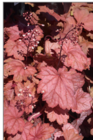
Georgia Peach Coral Bells in bloom