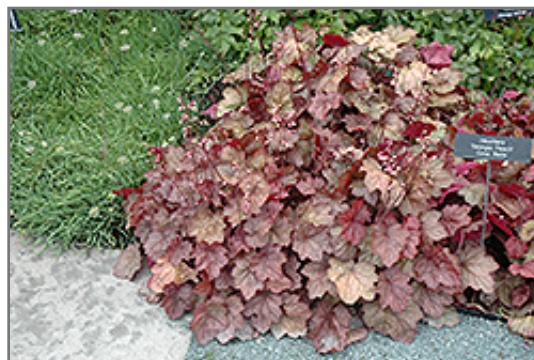
Georgia Peach Coral Bells

Georgia Peach Coral Bells is recommended for the following landscape applications;