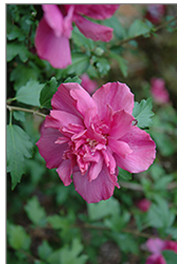
Boule de Feu Rose of Sharon flowers

Boule de Feu Rose of Sharon is recommended for the following landscape applications;