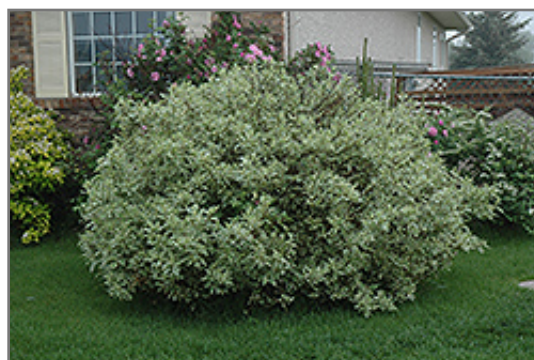
Ivory Halo Dogwood