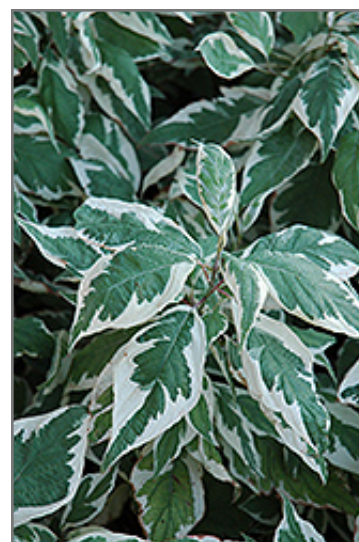
Ivory Halo Dogwood foliage