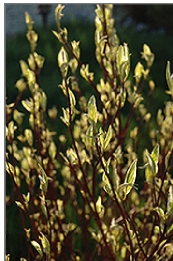
Ivory Halo Dogwood in spring

This shrub does best in full sun to partial shade. It is an amazingly adaptable plant, tolerating both dry conditions and even some standing water. It is not particular as to soil type or pH. It is highly tolerant of urban pollution and will even thrive in inner city environments. This is a selected variety of a species not originally from North America.