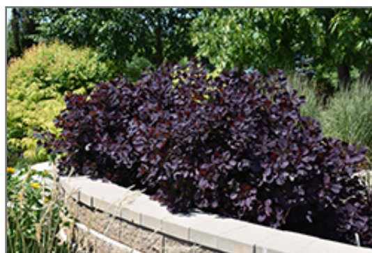
Royal Purple Smokebush