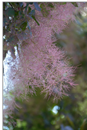
Royal Purple Smokebush flowers

This shrub should only be grown in full sunlight. It is very adaptable to both dry and moist locations, and should do just fine under average home landscape conditions. It is not particular as to soil type or pH. It is highly tolerant of urban pollution and will even thrive in inner city environments, and will benefit from being planted in a relatively sheltered location. This is a selected variety of a species not originally from North America.