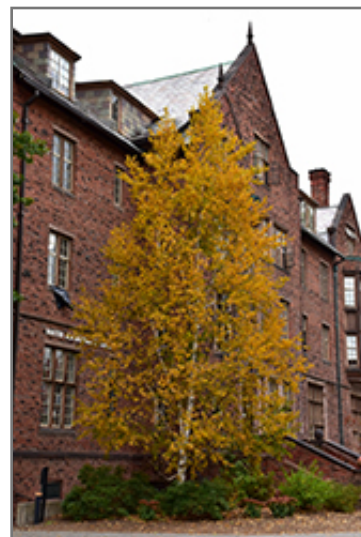
Renaissance Reflection Paper Birch in fall