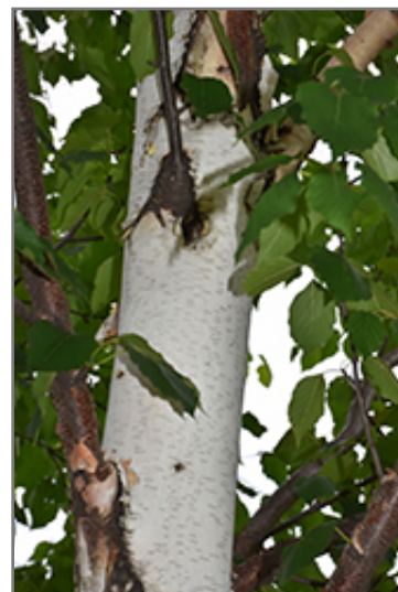
Renaissance Reflection Paper Birch bark

This tree does best in full sun to partial shade. It prefers to grow in average to moist conditions, and shouldn't be allowed to dry out. It is not particular as to soil type or pH. It is somewhat tolerant of urban pollution. Consider applying a thick mulch around the root zone in winter to protect it in exposed locations or colder microclimates. This is a selection of a native North American species.