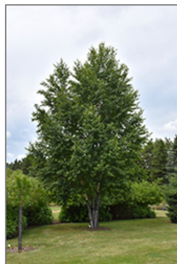
Renaissance Reflection Paper Birch