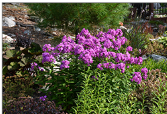
Flame Purple Garden Phlox in bloom