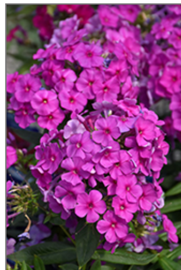
Flame Purple Garden Phlox flowers

Flame Purple Garden Phlox will grow to be about 10 inches tall at maturity, with a spread of 10 inches. When grown in masses or used as a bedding plant, individual plants should be spaced approximately 8 inches apart. It grows at a medium rate, and under ideal conditions can be expected to live for approximately 10 years. As an herbaceous perennial, this plant will usually die back to the crown each winter, and will regrow from the base each spring. Be careful not to disturb the crown in late winter when it may not be readily seen!