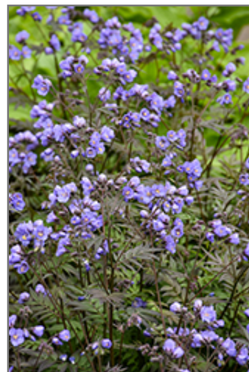
Heaven Scent Jacob's Ladder

Heaven Scent Jacob's Ladder is recommended for the following landscape applications;