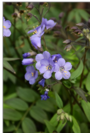
Heaven Scent Jacob's Ladder flowers

Heaven Scent Jacob's Ladder is a fine choice for the garden, but it is also a good selection for planting in outdoor pots and containers. With its upright habit of growth, it is best suited for use as a 'thriller' in the 'spiller-thriller-filler' container combination; plant it near the center of the pot, surrounded by smaller plants and those that spill over the edges. Note that when growing plants in outdoor containers and baskets, they may require more frequent waterings than they would in the yard or garden.