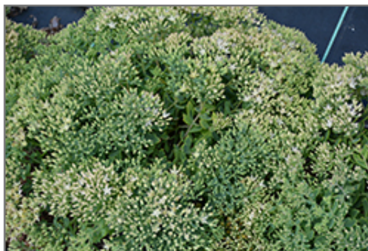
Thundercloud Stonecrop flower buds

Thundercloud Stonecrop is a fine choice for the garden, but it is also a good selection for planting in outdoor pots and containers. It is often used as a 'filler' in the 'spiller-thriller-filler' container combination, providing a mass of flowers and foliage against which the thriller plants stand out. Note that when growing plants in outdoor containers and baskets, they may require more frequent waterings than they would in the yard or garden.