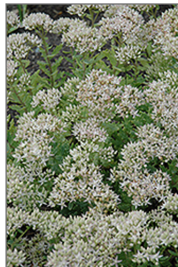
Thundercloud Stonecrop flowers

This is a relatively low maintenance plant, and is best cleaned up in early spring before it resumes active growth for the season. It is a good choice for attracting bees and butterflies to your yard, but is not particularly attractive to deer who tend to leave it alone in favor of tastier treats. It has no significant negative characteristics.