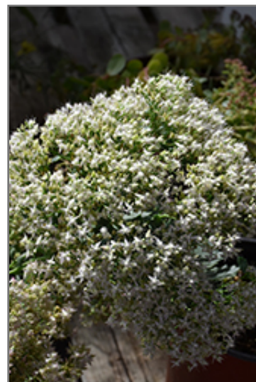
Thundercloud Stonecrop flowers

Thundercloud Stonecrop is a fine choice for the garden, but it is also a good selection for planting in outdoor pots and containers. It is often used as a 'filler' in the 'spiller-thriller-filler' container combination, providing a mass of flowers and foliage against which the thriller plants stand out. Note that when growing plants in outdoor containers and baskets, they may require more frequent waterings than they would in the yard or garden.