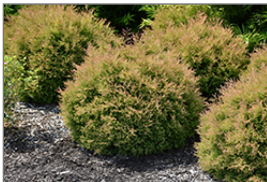
Fire Chief Arborvitae

Fire Chief Arborvitae will grow to be about 5 feet tall at maturity, with a spread of 5 feet. It tends to fill out right to the ground and therefore doesn't necessarily require facer plants in front, and is suitable for planting under power lines. It grows at a slow rate, and under ideal conditions can be expected to live for approximately 30 years.