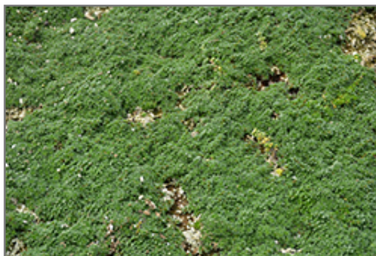
Elfin Creeping Thyme

Elfin Creeping Thyme will grow to be only 2 inches tall at maturity extending to 3 inches tall with the flowers, with a spread of 18 inches. When grown in masses or used as a bedding plant, individual plants should be spaced approximately 16 inches apart. Its foliage tends to remain low and dense right to the ground. It grows at a fast rate, and under ideal conditions can be expected to live for approximately 10 years. As an evergreen perennial, this plant will typically keep its form and foliage year-round.