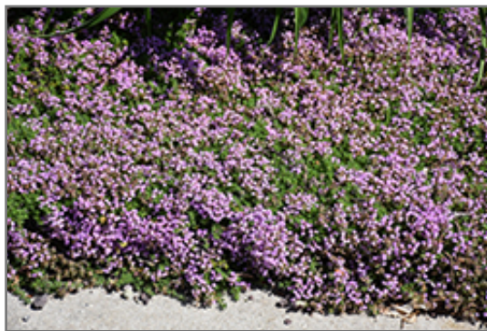
Elfin Creeping Thyme in bloom