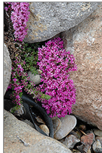
Pink Chintz Creeping Thyme in bloom