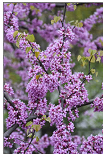
Eastern Redbud flowers