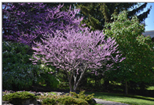
Eastern Redbud in bloom