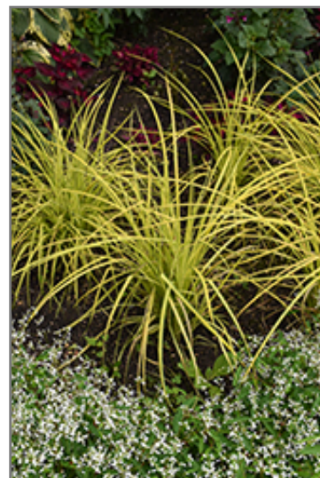
Bowles' Golden Sedge

Bowles' Golden Sedge is recommended for the following landscape applications;