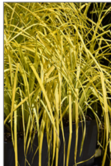
Bowles' Golden Sedge foliage