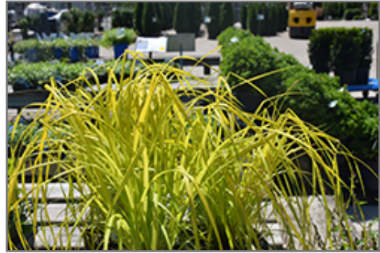
Bowles' Golden Sedge

Bowles' Golden Sedge will grow to be about 18 inches tall at maturity extending to 24 inches tall with the flowers, with a spread of 18 inches. Its foliage tends to remain dense right to the ground, not requiring facer plants in front. It grows at a slow rate, and under ideal conditions can be expected to live for approximately 10 years. As an herbaceous perennial, this plant will usually die back to the crown each winter, and will regrow from the base each spring. Be careful not to disturb the crown in late winter when it may not be readily seen!