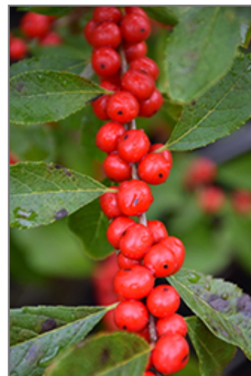
Red Sprite Winterberry fruit

Red Sprite Winterberry is recommended for the following landscape applications;