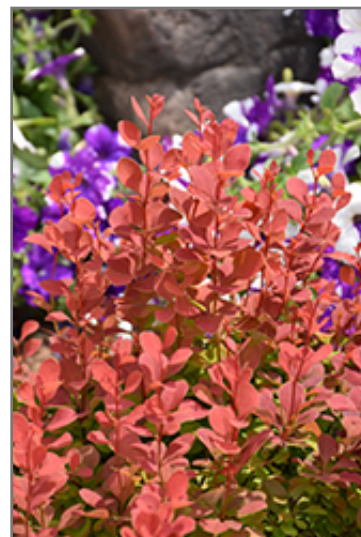
Orange Rocket Japanese Barberry foliage