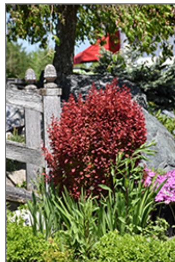
Orange Rocket Japanese Barberry

This shrub does best in full sun to partial shade. It is very adaptable to both dry and moist growing conditions, but will not tolerate any standing water. It is considered to be drought-tolerant, and thus makes an ideal choice for xeriscaping or the moisture-conserving landscape. It is not particular as to soil type or pH, and is able to handle environmental salt. It is highly tolerant of urban pollution and will even thrive in inner city environments. This is a selected variety of a species not originally from North America.