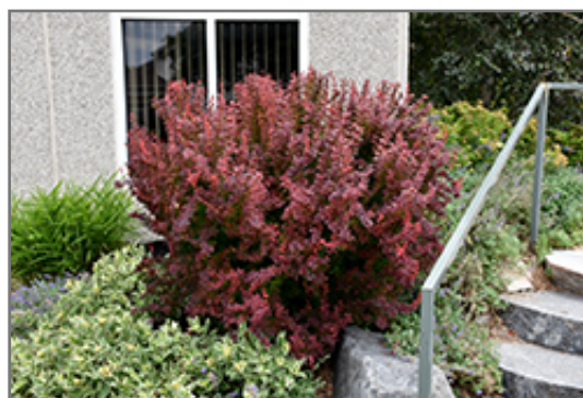
Orange Rocket Japanese Barberry