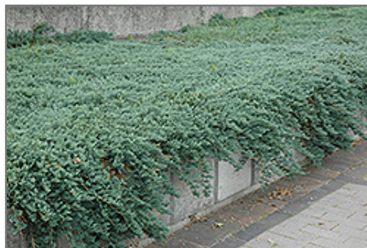
Icee Blue Juniper

Icee Blue Juniper is recommended for the following landscape applications;