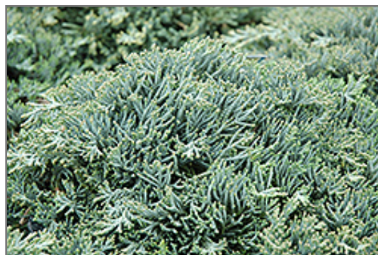
Icee Blue Juniper foliage