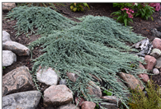
Icee Blue Juniper

Icee Blue Juniper will grow to be about 8 inches tall at maturity, with a spread of 6 feet. It tends to fill out right to the ground and therefore doesn't necessarily require facer plants in front. It grows at a slow rate, and under ideal conditions can be expected to live for approximately 30 years.