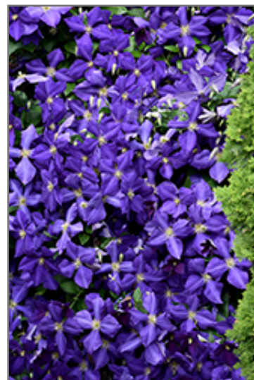
Jackmanii Clematis in bloom