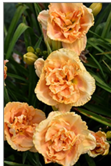
Rainbow Rhythm Siloam Peony Display Daylily flowers

Rainbow Rhythm Siloam Peony Display Daylily is recommended for the following landscape applications;