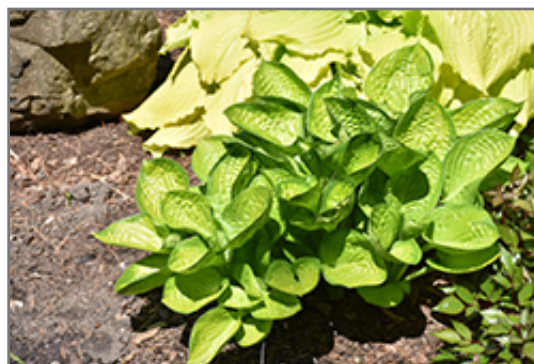
Rainforest Sunrise Hosta