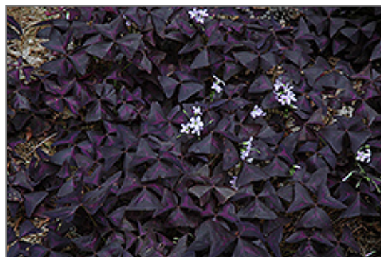
Purple Shamrock foliage