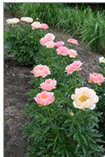
Coral Sunset Peony in bloom