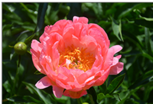
Coral Sunset Peony flowers

Coral Sunset Peony is recommended for the following landscape applications;