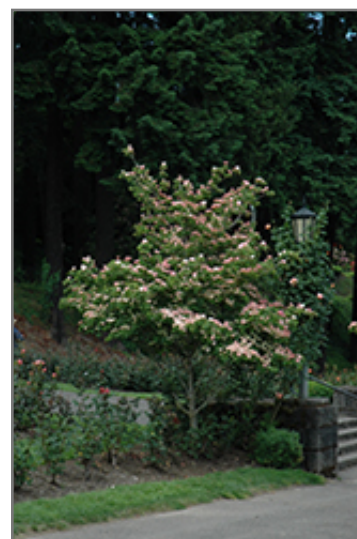
Heart Throb Chinese Dogwood in bloom