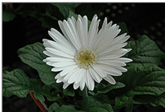
White Gerbera Daisy flowers

When grown indoors, White Gerbera Daisy can be expected to grow to be about 12 inches tall at maturity extending to 16 inches tall with the flowers, with a spread of 12 inches. It grows at a fast rate, and under ideal conditions can be expected to live for approximately 3 years. This houseplant will do well in a location that gets either direct or indirect sunlight, although it will usually require a more brightly-lit environment than what artificial indoor lighting alone can provide. It does best in average to evenly moist soil, but will not tolerate standing water. The surface of the soil shouldn't be allowed to dry out completely, and so you should expect to water this plant once and possibly even twice each week. Be aware that your particular watering schedule may vary depending on its location in the room, the pot size, plant size and other conditions; if in doubt, ask one of our experts in the store for advice. It is not particular as to soil type or pH; an average potting soil should work just fine.